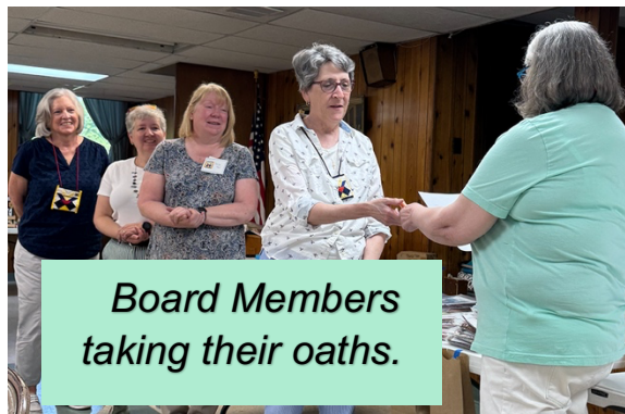
Board Members taking their oaths.